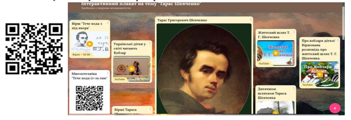
Fig. 4. Interactive poster "Taras Shevchenko"

Scanning this QR-code one can immerse oneself in the world of Taras Shevchenko - a modernized, stylish, unpredictable perspective.