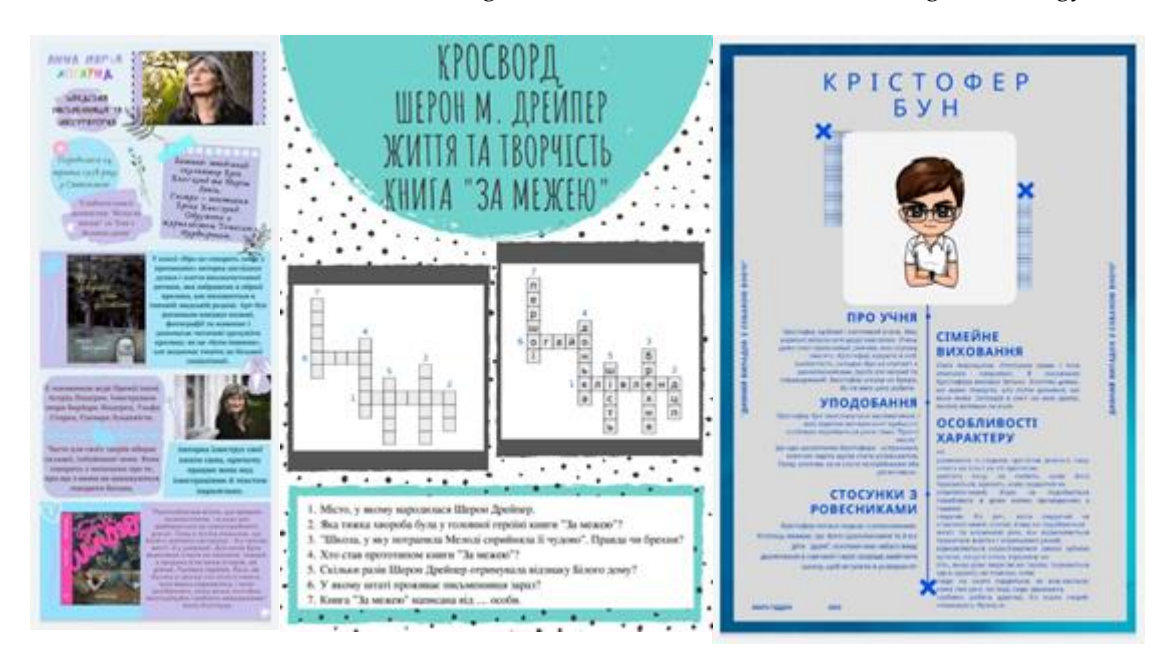
Fig. 3. Interactive posters, academic course "Literature and Inclusion"

Students tried to balance illustrative and textual material, but it was not always possible due to lack of experience, as well as excessive fascination with biographical video material, which could take away attention from the author as well as his/her work, or excessive overload with texts due to inability to choose the most important.