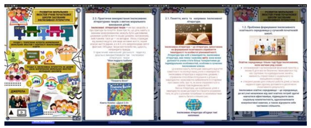
Fig. 2. Interactive poster of the course work

One of the common mistakes when creating interactive posters as a visualization of a fiction text is that students are more concerned with the form, the picture, rather than the content. The preparation of posters based on the materials of the course work eliminated this moment, because the main task was to present the necessary material, without additional research work. At this stage, the main objectives were to master the relevant platform and adapt the material of the course work. Moreover, this technique turned out to be perfect for online coursework defense.