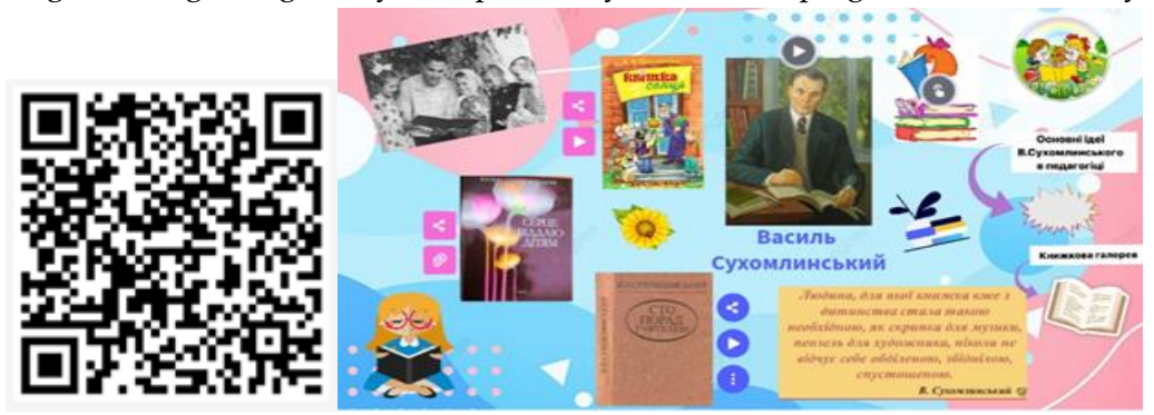
Fig. 5. Interactive poster "Vasyl Sukhomlynsky"

As can be seen, game technologies are widely presented, because they are the most natural and attractive activity for primary school students. During the game, children develop the habit of concentrating, working thoughtfully, independently, and developing attention, memory.