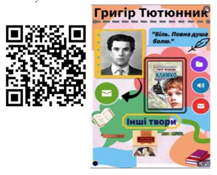
Fig. 6. Interactive poster "H. Tyutyunnyk"

To create such posters, students had to study the author's biography, read his work, review the available media content, and reject unnecessary, low-quality or false information. This type of work helps look at a fiction work in a different way, pay attention to details which were not previously considered; teaches to distinguish the main aspect within the writer's biography and work, and visualizes the studied material. An important role is played by the oral (now online) poster defense, as it demonstrates the level of mastery of the processed material, the ability to manipulate the facts and analyze fiction literature.