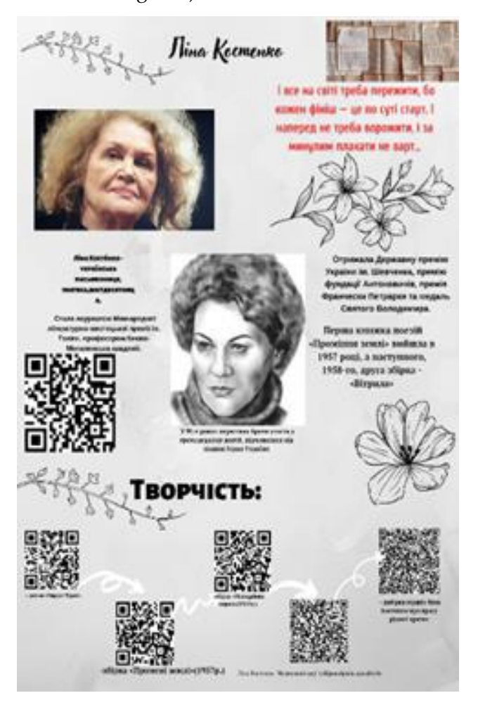
Fig. 8. Interactive poster "Lina Kostenko"

Studying O. Savchenko's textbook (for schools with the Ukrainian language of study), students get acquainted with the works of 36 Ukrainian poets. Among them is Lina Kostenko (poem "Nightingale caught a cold" - the 3rd grade).