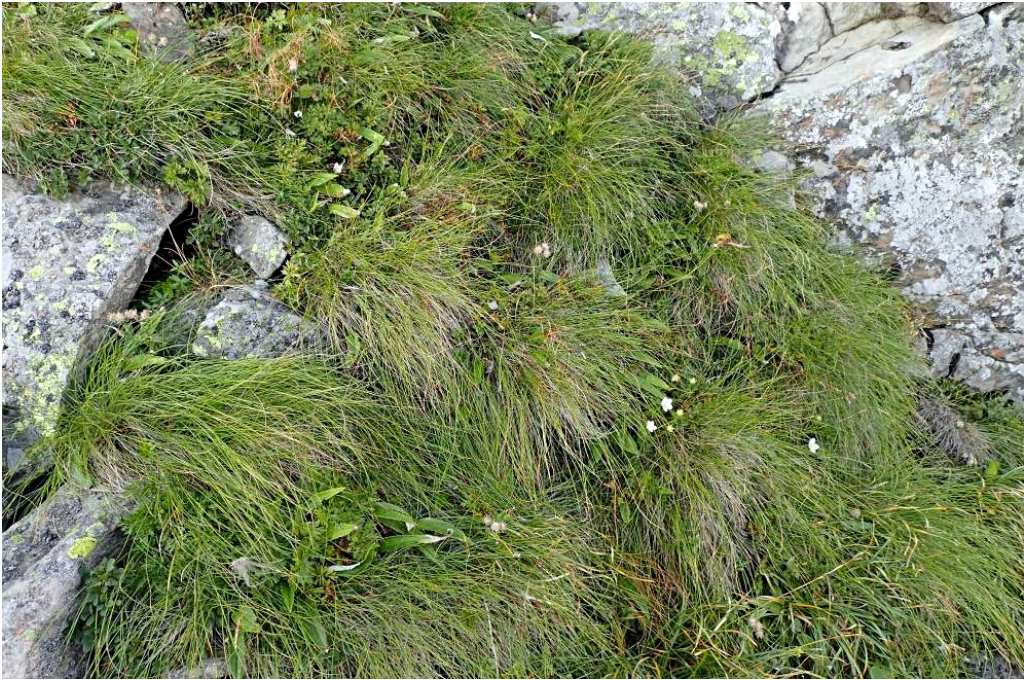
Fig. 1. Rocky coenosis of the Saussurea alpina (L.) DC. population on Mt. Shpyci (Chornohora massif), being overgrowth by highdensity species ( Carex sempervirens Vill.)