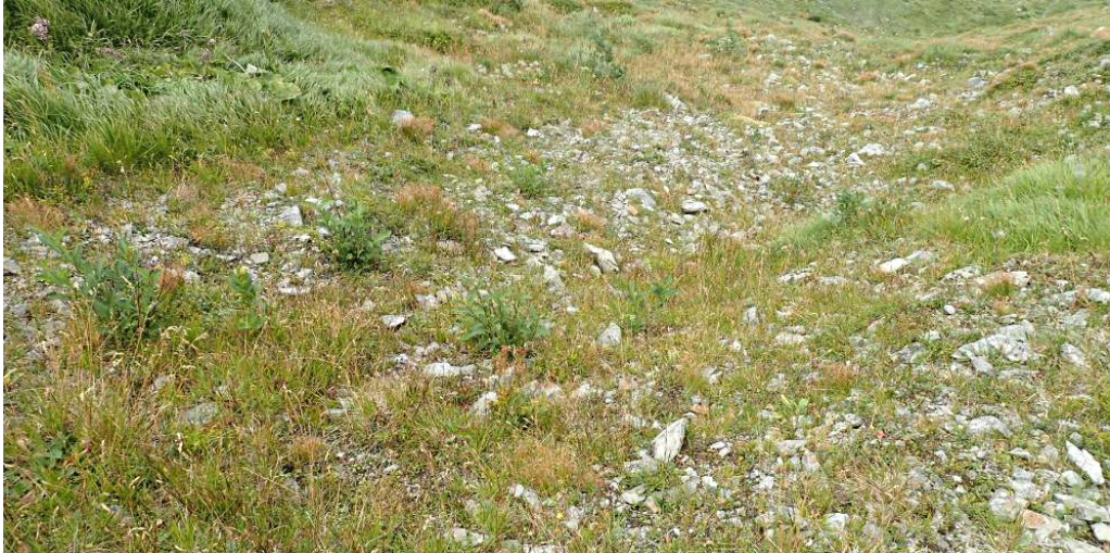
Fig. 3. Bartsia alpina L. habitat on the north-eastern slope of Mt. Rebra Рис. 3. Оселище Bartsia alpina L. на північно-східному схилі гори Ребра

Rejuvenation of populations and an increasing of pregenerative phases duration, in particular – immature and virginile periods, are observed (Fig. 4). Such process has an important adaptive and evolutionary value, since a transition to the generative phase of ontogenesis occurs only in conditions favorable for this.