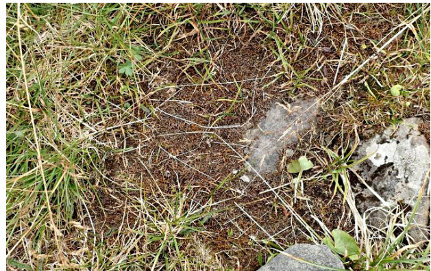
Fig. 2. Drying out of the substrate in the Pedicularis oederi Vahl habitat between Brebeneskul and Munchel mountains due to climatic changes

Pedicularis oederi propagates only by seeds, therefore, the populations vitality depends on the efficiency of generative reproduction and the area of suitable habitats. During the vegetation season in 2018 a sufficient humidification of the habitat, significantly increasing number of flowering individuals (60 pieces in the first fragment and 30 pieces – in the second), increasing the coefficient of generative reproduction to 60 % are observed in the upper loci of Pedicularis oederi population. Unstable demographic trends in the population – flowering outbreaks and flowering decline, a significant fluctuation in number of pregenerative individuals and the recovery index (Table 4) due to dependence of populations' self-maintenance and self-recovery primarily on substrate moisture and availability of suitable locus for germination. Further existence of the upper locus of the population may be at risk under the conditions of habitat drying out and overgrown.