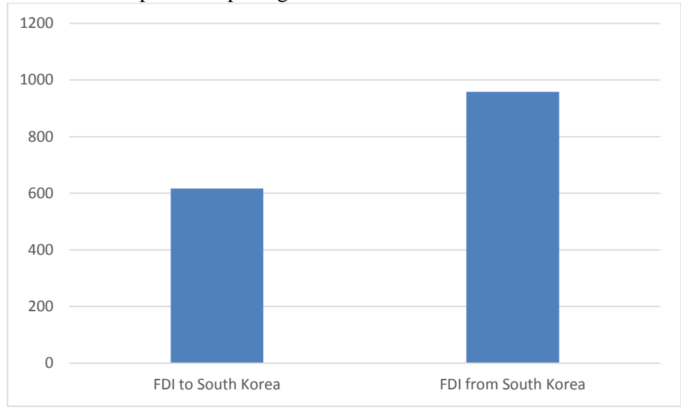
Fig. 3. FDI flows between Japan and South Korea (in millions of dollars) [6]

The next graph shows the FDI flows between Japan and South Korea. The unexpected result of this statistical information is that South Korea invests more in Japan than vice versa. This important detail clearly shows how over the course of time, South Korea was not only able to develop itself but also change the FDI flows. So now it invests in Japan. The main categories of FDI which South Korea invests in Japan are communications, finance and insurance. The main categories of FDI which Japan invests in South Korea are electric machinery, communications, finance and insurance. The situation of ranking stays approximately the same as it is in trade statistics, South Korea is 4<sup>th</sup> or 5<sup>th</sup>, USA still remains the largest investor and investment destination both for Japan and South Korea. This could also serve as another example of deepening relations between two countries.